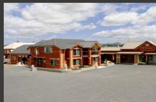
Sheffield Motor Inn, 49-53 Main Street, Sheffield TAS 7306 Ph: +61 (03) 6491 1800 Email: enquiries@sheffieldmotorinn.com.au

Sheffield Motor Inn has been voted as Best Golden Chain Motel in Tasmania – 2009. The Motor Inn was voted for by guests as providing the best facilities and service in Tasmania. Additionally, Sheffield Motor Inn won the 2008 Tasmanian Tourism People's Choice Award. The Sheffield Motor Inn provides for a variety of accommodation needs, offering visitors the option of en-suite motel units, family rooms, studio and self-contained apartments that sleep up to 7 people. Sheffield Motor Inn is located in Sheffield, 'Town of Murals' that lies within the northwest coast region of Tasmania. Sheffield is located 30 minutes from Devonport where the Spirit of Tasmania I and II disembark and 60 minutes from Cradle Mountain.